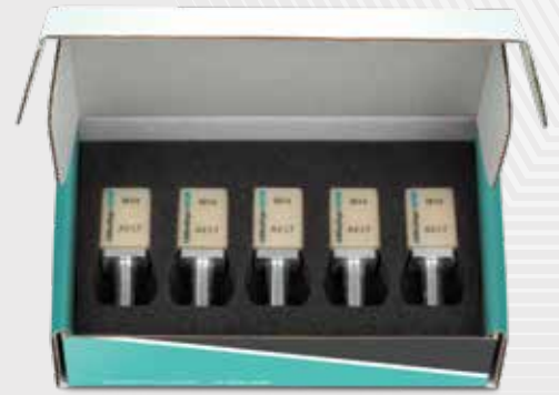
Sold in 5-block packs